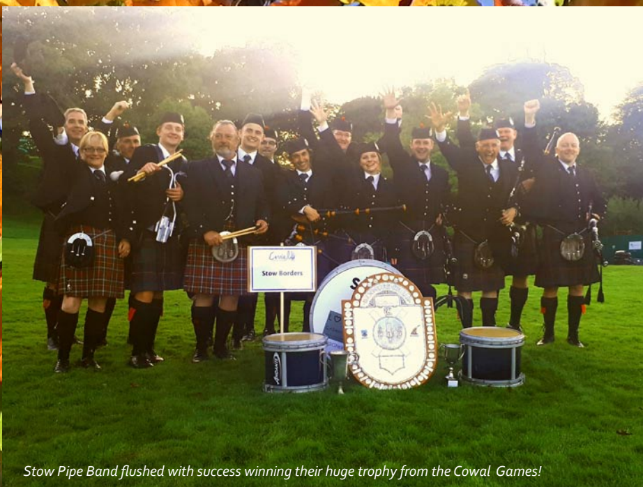
Stow Pipe Band flushed with success winning their huge trophy from the Cowal Games!