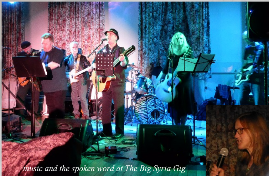
music and the spoken word at The Big Syria Gig