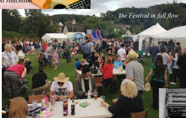
the Festival in full flow