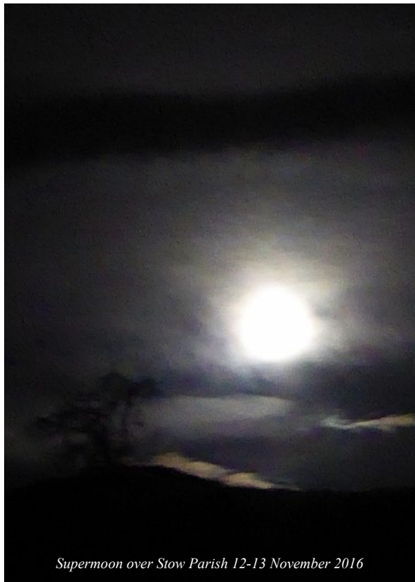
Supermoon over Stow Parish 12-13 November 2016