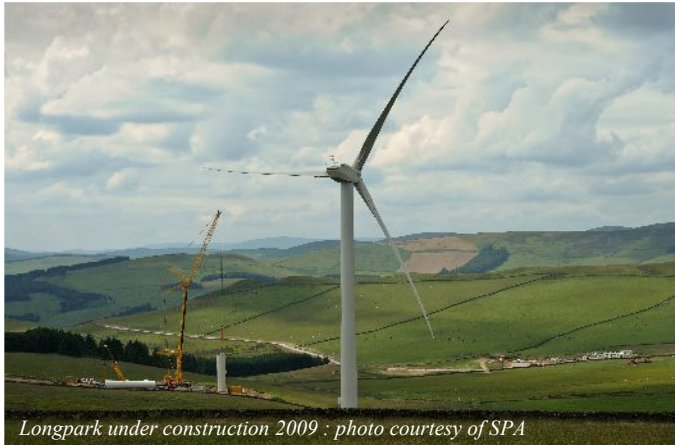
Longpark under construction 2009

Foundation Scotland have recently sent us the following useful update about the Windfarm Community Benefit Fund.