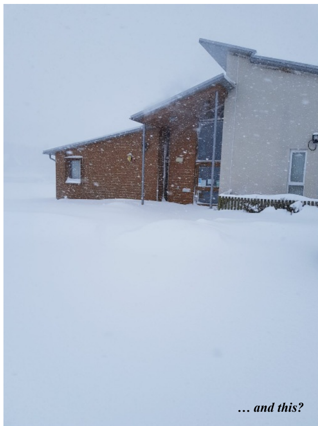
... and this?