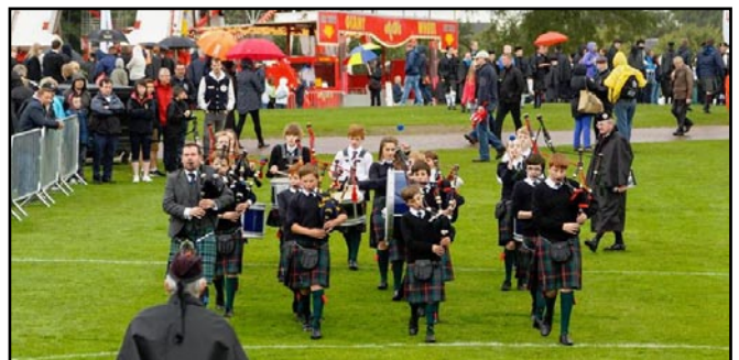
Stow Borders Juvenile Pipe Band competing earlier this year.