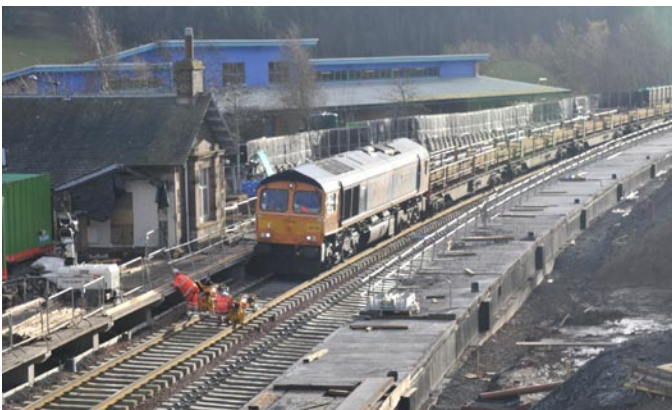
Two of many photographs held by Stow Parish Archive