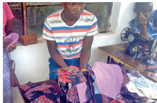
◀▲ Young tailors making reusable hygiene kits for school girls.

If you are interested in sponsoring a tailor, please follow the link below: https://www.justgiving.com/crowdfunding/tailorsfordignity