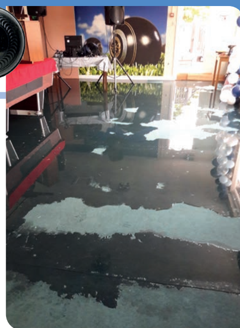
Water, water everywhere – the clubhouse at the start of the flooding