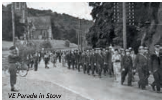
VE Parade in Stow