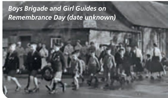
Boys Brigade and Girl Guides on Remembrance Day (date unknown)

Back at the hall, there were teas and coffees while looking at the images further illustrating Alistair's time here and swapping more stories.