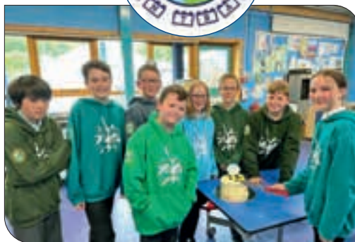
The 'class of '22' get ready to cut their graduation cake on the last day before the summer holidays – and High School!