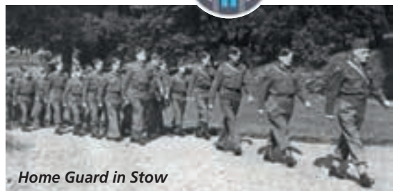
Home Guard in Stow