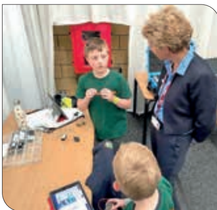
Two of the Stow Disrupters explain their work at the Inspire Learning Festival